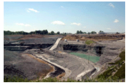
Meticulous preparations of the land fill assures long-term quality at Rumpke Sanitary Landfill