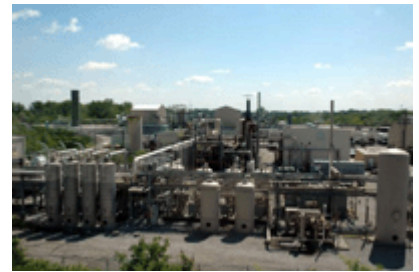
Methane Conversion to Natural Gas Supplies 25,000 Homes/Day at Rumpke Sanitary Landfill