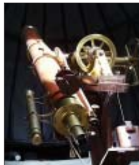
The World's oldest professional telescope still in public use - a Merz and Mahler.

Lookout in 1873 to escape the increasing city smog, the original cornerstone was embedded in the new observatory building, and the building and grounds were deeded to the University of Cincinnati.