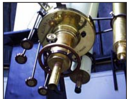
A second telescope, an Alvi Clark and Sons was purchased in 1904. Note the mechanical clock drive.

Scientific work done by astronomers at the Cincinnati Observatory over the past 162 years was as much responsible for its designation as a National Historic