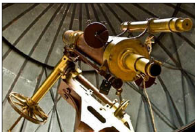
1843 Merz & Mahler 11" Refractor. The oldest professional telescope in the Western Hemisphere still in use nightly by the public.